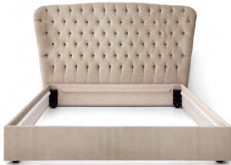
FOLD DOUBLE BED