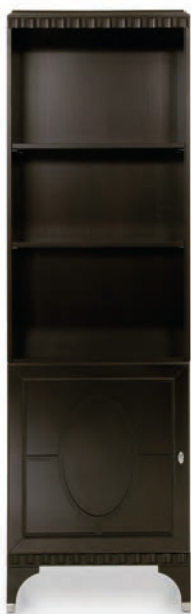
LEFT OPENING BOOKCASE

Finish: MC - Modern cherry - Cat. ZE Standard: Extensions 2 x 50 cm included Metal tips leg: Gold plated W. 222 D. 112 H. 78