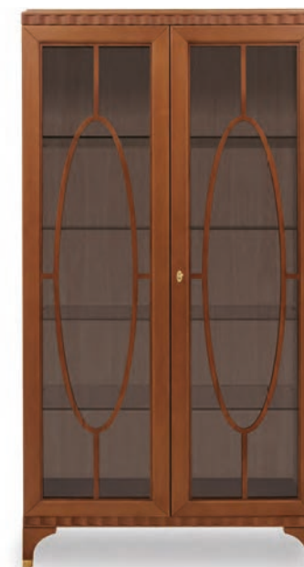
2 DOOR GLASS CASE

Art. 00CO352 Finish: MC - Modern cherry - cat. ZE Standard: metal tip legs included W. 228 D. 53 H. 91