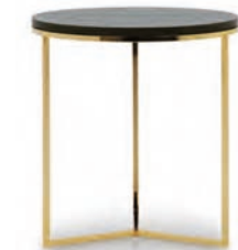
TRIO LAMP TABLE

Marble top: Emperador dark Metal base: Gold plated W. 80 D. 80 H. 41