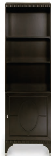
RIGHT OPENING BOOKCASE

Finish: WE - Wengé - Cat. ZE Standard: Metal tips leg W. 70 D. 42 H. 221