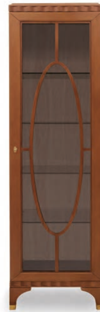
RIGHT OPENING GLASS CASE

Finish: MC - Modern cherry - Cat. ZE Standard: Metal tips leg W. 70 D. 42 H. 221