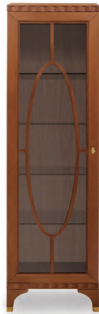
LEFT OPENING GLASS CASE