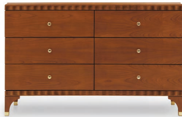
CHEST OF DRAWERS

Finish: MC - Modern cherry - Cat. ZE Metal tips leg: Gold plated W. 140 D. 55 H. 130