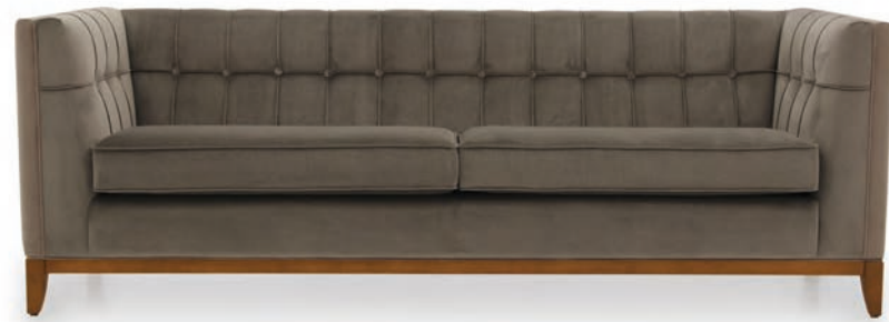
LIXIS 4 SEATER SOFA