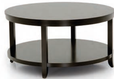
KYLINDO COFFEE TABLE