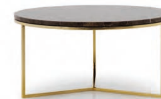
TRIO COFFEE TABLE

Smoked Glass top Metal base: powder coated Giove Brass color - V W. 120 D. 70 H. 40