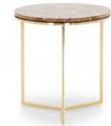
TRIO LAMP TABLE

Finish: P3 - Moka - cat. ZA Upholstery: Fabric ANS - Cat. A Trimming: Self piping Standard: Buttons on the back included W. 230 D. 82 H. 80 SH. 51 AH. 80