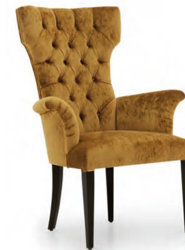
QUEEN SMALL ARMCHAIR

Finish: P3 - Moka - Cat. ZA Upholstery: Combination J07 M83+E98 - Cat. D Trimmings: Self piping W. 53,5 D. 60 H. 90