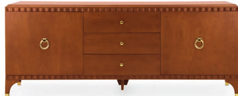
2 DOORS SIDEBOARD WITH DRAWERS

Art. 00CO351 Finish: O6 - English mahogany - cat. ZB Standard: metal tip legs included W. 228 D. 53 H. 96