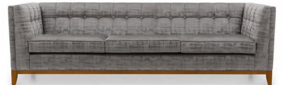
LIXIS 5 SEATER SOFA

Finish: MC - Modern cherry - Cat. ZE Upholstery: Fabric LJJ - Cat. B Trimmings: Self piping W. 96 D. 81 H. 51