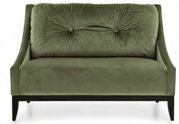
DOROTEA 2 SEATER SOFA

Finish: P3 - Moka - Cat. ZA Upholstery: Fabric M4Z - Cat. C Trimmings: Self piping Standard: Loose cushion included W. 72 D. 85 H. 89