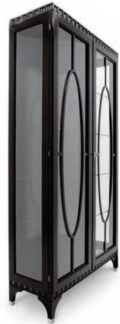
2 DOORS GLASS CUPBOARD