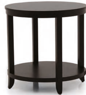
KYLINDO LAMP TABLE

Finish: WE - Wengé - Cat. ZE W. 90 D. 90 H. 45,5