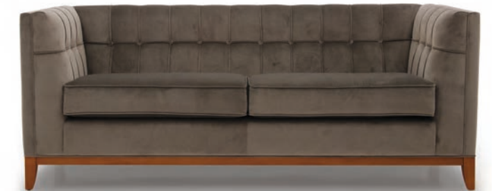
LIXIS 3 SEATER SOFA

Finish: MC - Modern cherry - Cat. ZE Upholstery: Fabric AD3 - Cat. A Trimmings: Self piping Standard: Buttons on the back included W. 95 D. 80 H. 80