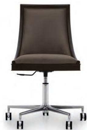
AMINA SWIVEL CHAIR

Finish: WE - Wengé - Cat. ZE Upholstery: Fabric DAH - Cat. D Trimmings: F - Shaded nails Standard: Round handle on the back included Optional: Tufted back not included W. 46 D. 56 H. 95