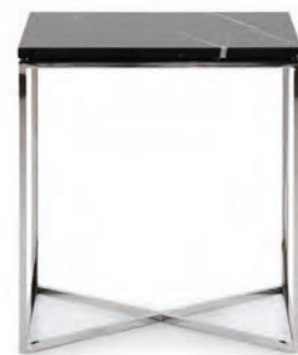
KLEPSIDRA LAMP TABLE

Marble top: Carrara white Metal base: Chrome W. 130 D. 80 H. 40