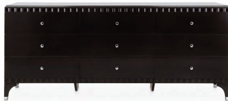
9 DRAWERS SIDEBOARD

Art. 00CR352 Finish: MC - Modern cherry - Cat. ZE W. 220 D. 55 H. 85