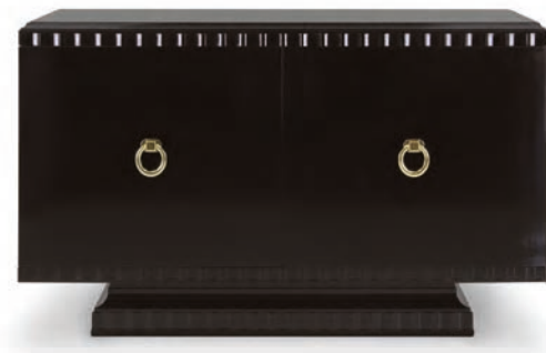
2 DOORS SIDEBOARD

Art. 00CR356 Finish: O6 - English mahogany - cat. ZB Standard: metal tip legs included W. 152 D. 59 H. 91