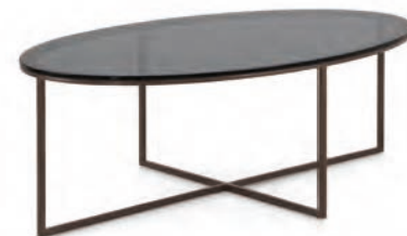
TRIO COFFEE TABLE

Upholstery: Fabric MA2 - Cat. C Standard: Loose cushions #CUS59 included W. 230 D. 100 H. 84