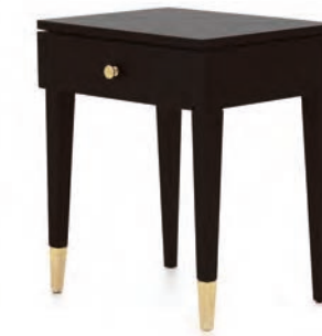
LOOK SINGLE DRAWER NIGHTSTAND

Finish: P3 - Moka - Cat. ZA Upholstery: Fabric LRW - Cat. B Optional: Quilted design on the headboard not included W. 120 D. 9,5 H. 150