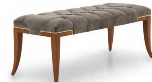
IDRA UPHOLSTERED BENCH

Upholstery: Fabric LJK - Cat. B W. 51 D. 51 H. 50