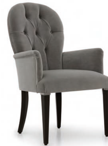
CALIPSO SMALL ARMCHAIR