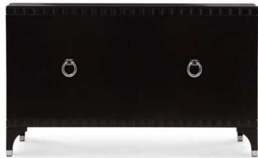
2 DOORS SIDEBOARD

Art. 00CR356 Finish: O6 - English mahogany - cat. ZB Standard: metal tip legs included W. 152 D. 59 H. 91