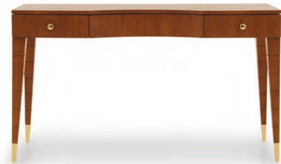
LOOK DRESSING TABLE