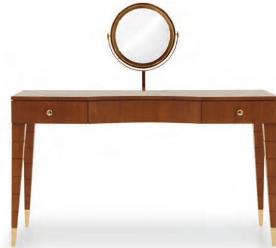
LOOK DRESSING TABLE WITH SWIVEL MIRROR

Finish: MC - Modern cherry - Cat. ZE Metal tips leg: Gold plated W. 140 D. 55 H. 80