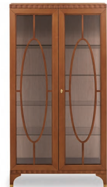
2 DOORS DISPLAY CABINET GLASS SIDE PANELS

Art. 00VE350 Finish: MC - Modern cherry - Cat. ZE Standard: Metal tips leg W. 111 D. 42 H. 221