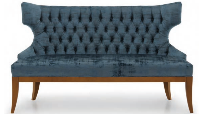
IRENE 2 SEATER SOFA

Finish: MC - Modern cherry - Cat. ZE Upholstery: Fabric LFS - Cat. B Trimmings: Self piping Standard: Tufted back included W. 77 D. 72 H. 86