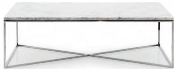
KLEPSIDRA COFFEE TABLE

Finish: MC - Modern cherry - Cat. ZE Upholstery: Fabric LF6 - Cat. B Trimmings: Self piping Standard: Buttons on the back included W. 200 D. 84 H. 80