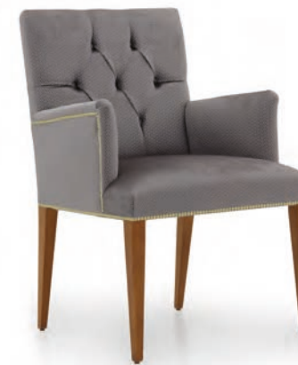
ARIANNA SMALL ARMCHAIR