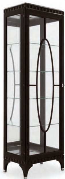
LEFT OPENING GLASS CUPBOARD

Finish: P3 - Moka - cat. ZA Standard: metal tip legs included Optional: mirror back not included W. 167 D. 42 H. 221