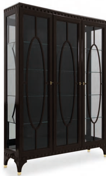
3 DOORS GLASS CUPBOARD

Finish: WE - Wengé - Cat. ZE Standard: Metal tips leg W. 111 D. 42 H. 221