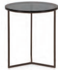
TRIO LAMP TABLE

Finish: MC - Modern cherry - Cat. ZE Upholstery: Combination H49 LF6+AD2 - Cat. B Trimmings: Self piping Standard: Buttons on the back included W. 230 D. 84 H. 80