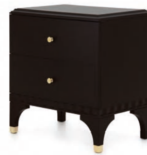
2 DRAWERS NIGHTSTAND

Finishing: P3 - Moka - Cat. ZA Upholstery: Combination H69 - Cat. B Optional: Quilted design on the headboard not included Standard: metal tip legs included Note: Mattress sizes 180 x 200 W. 193 D. 216 H. 145