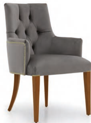
OLIMPIA SMALL ARMCHAIR

Finish: SG - Spring grey - Cat. ZD Upholstery: Fabric BXS - Cat. B Trimmings: J - Silver nails Optional: Chrome tip legs not included W. 49 D. 59 H. 97,5